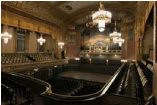
LISZT FERENC ACADEMY OF MUSIC, Budapest