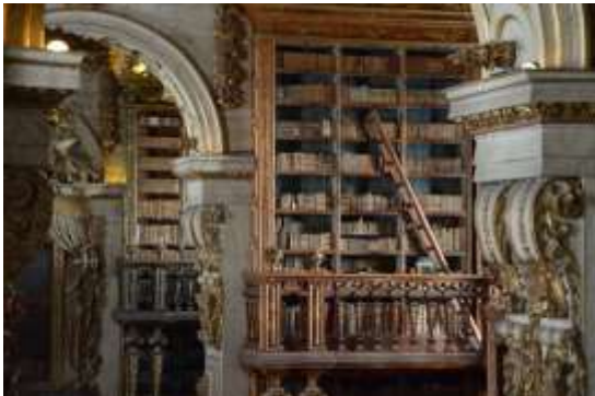
UNIVERSITY OF COIMBRA LIBRARY, Portugal