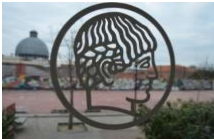
RESIDENCIA DE ESTUDIANTES, Madrid