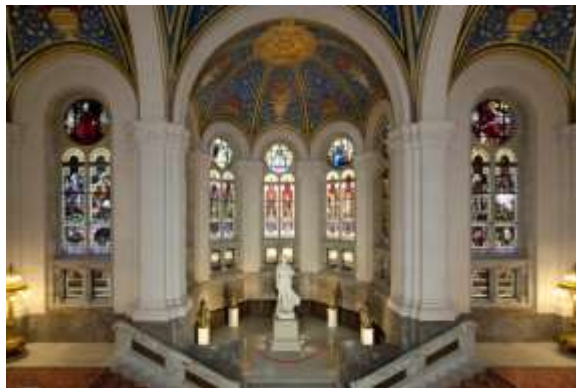
PEACE PALACE, The Hague