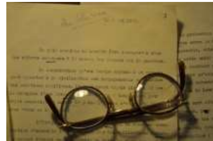
SCHUMAN'S HOUSE, Scy- Chazelles