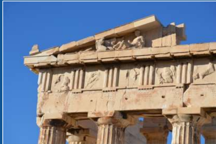
ANCIENT ATHENS, Greece